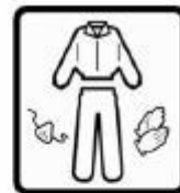
Cover exposed skin. When working in unventilated area wear disposable face mask