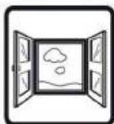
Ventilate working area if possible

"The mechanical effect of fibres in contact with skin may cause temporary itching"