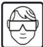
Wear goggles when working overhead