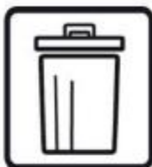
Waste should be disposed of according to local regulations